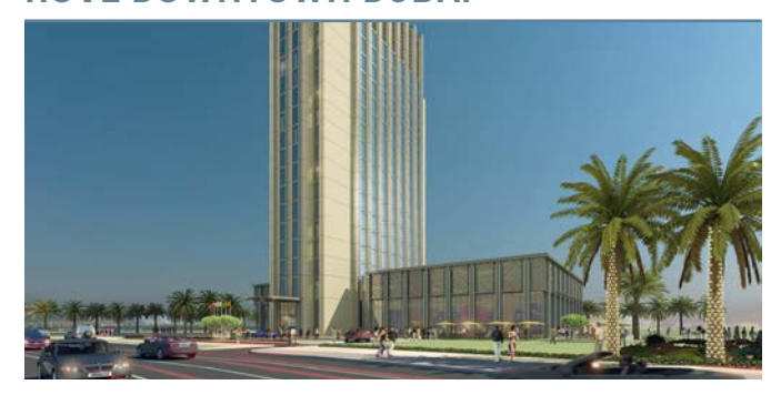
We offer a fresh way to enjoy Dubai. Rove Downtown Dubai is the perfect jumping-off point for city explorers.